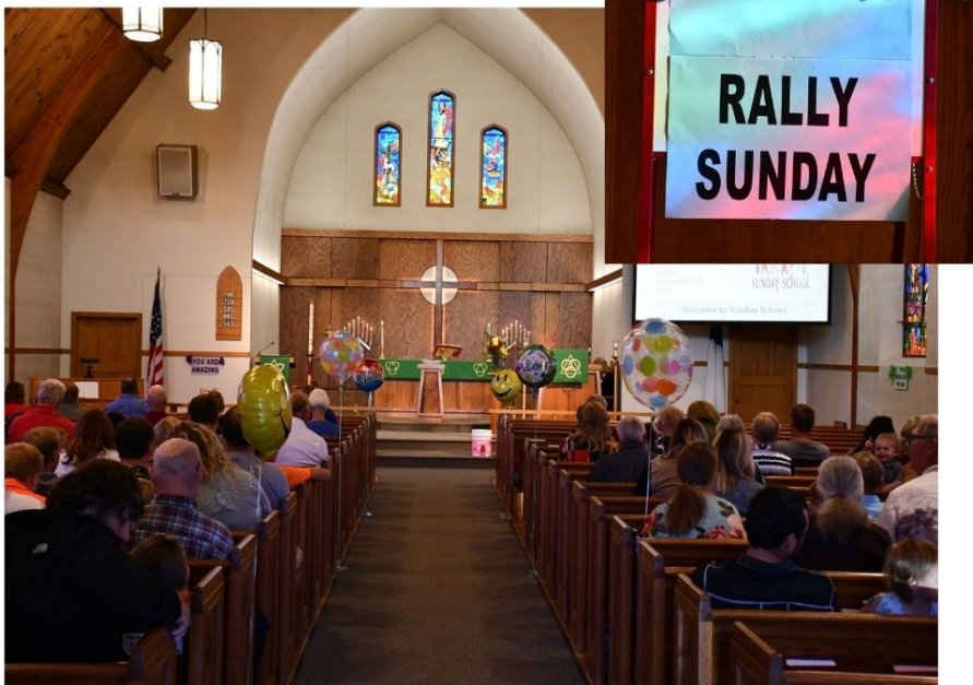
Thanks to Fawn Wiebke for the great photos!