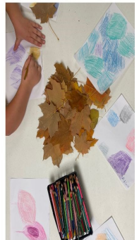
LOL used creative fall elements for a fun activity