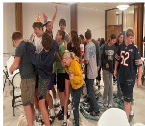
Confirmation students actively learning about leadership